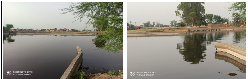
Storage and Sedimentation tank filled up with waste water of pond (16 March 2021)

However, during inspection in August 2018 by PHED officials, it was found that the waste water from pond had entered the water works and the structures were still submerged in waste water. To address this problem, the estimate was revised again with a provision for retaining wall for making the newly constructed S&S tank functional (January 2019). This was yet to be approved by the competent authority (March 2021). During physical verification (March 2021) of site, alongwith PHED officials, it was found that the entire water works were submerged in waste water of the village pond as depicted from the photographs below: